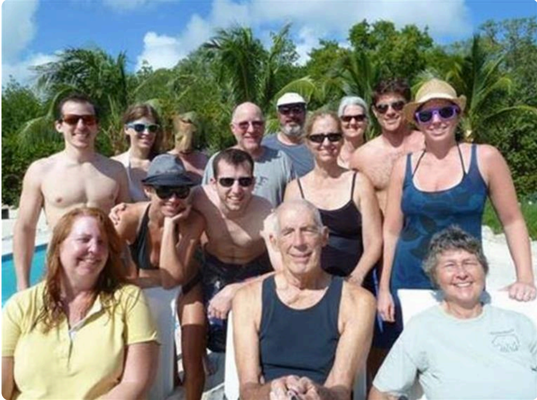
Family Time in the Keys