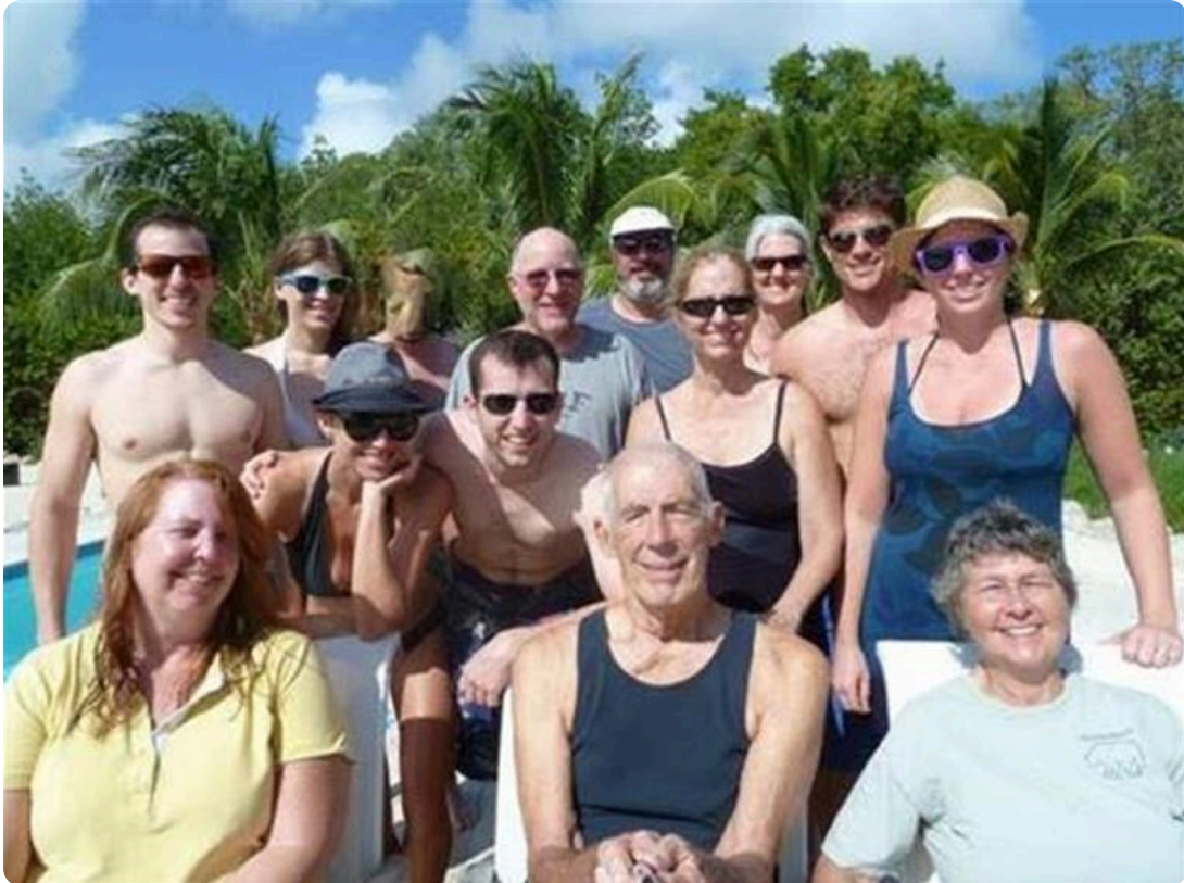
Family Time in the Keys