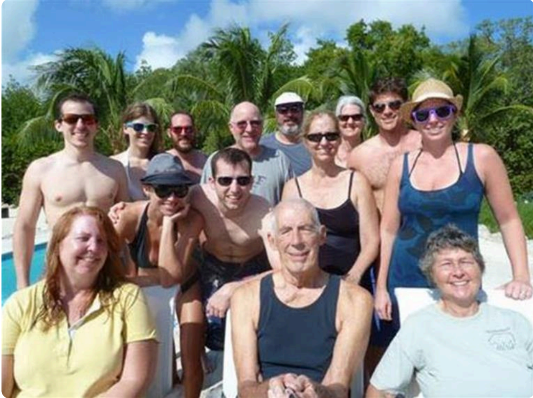
Family Time in the Keys