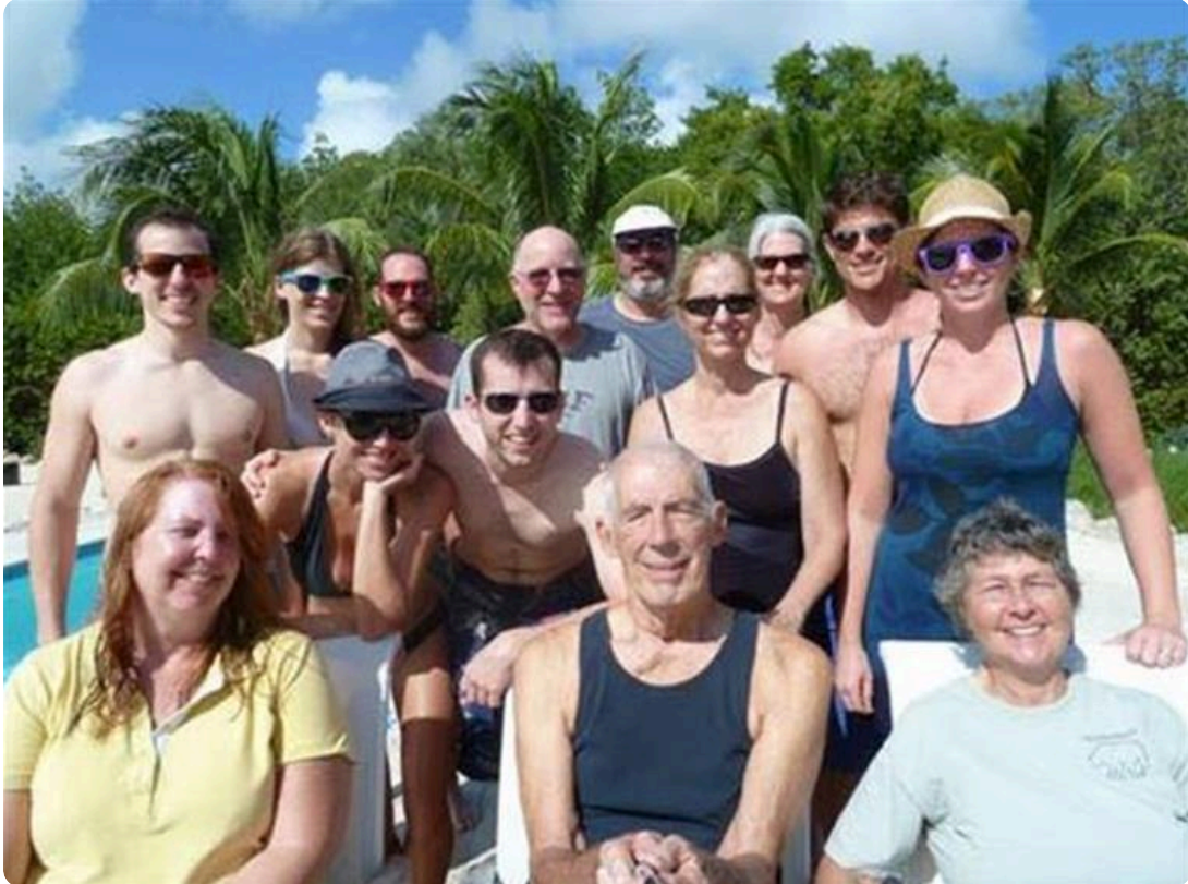
Family Time in the Keys